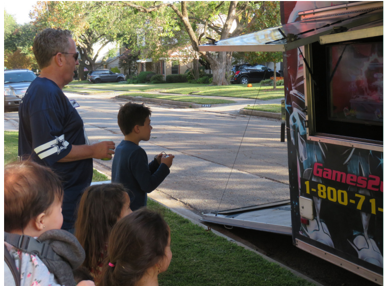
The Video-Game Truck was a hit with the kids