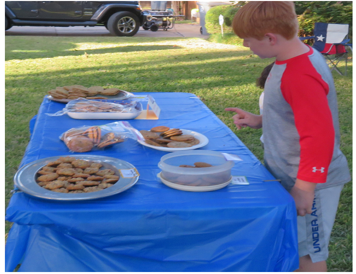
Hard decisions at the Cookie Table