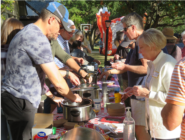
Nine Chili contestants entered the competition